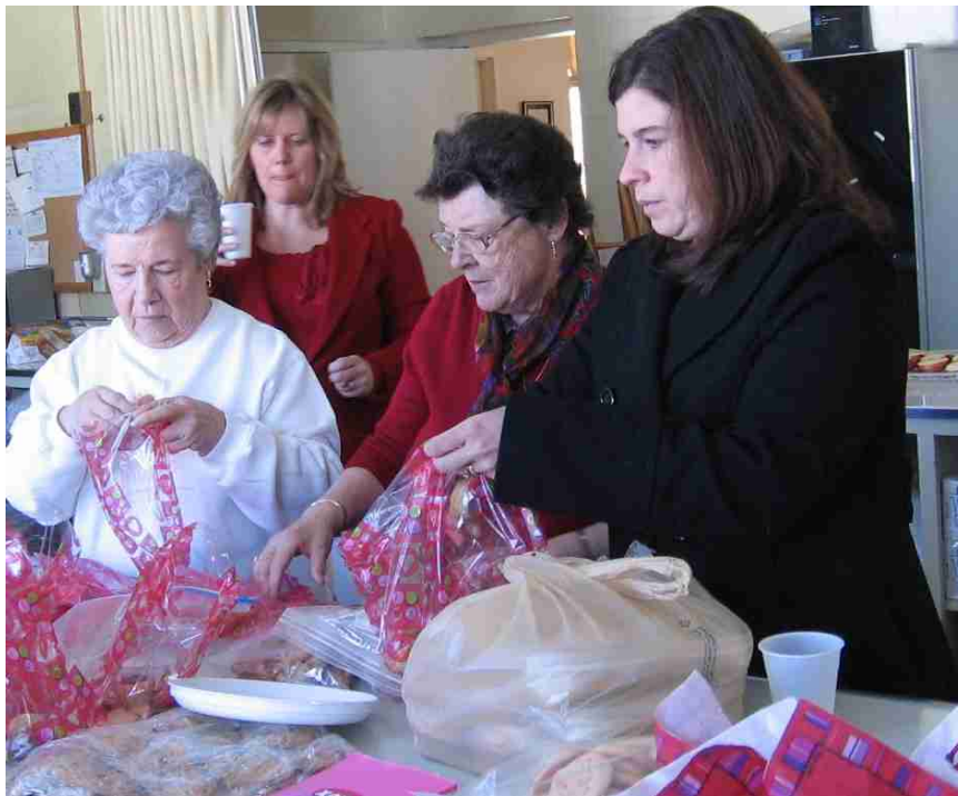
Where Valentines come from