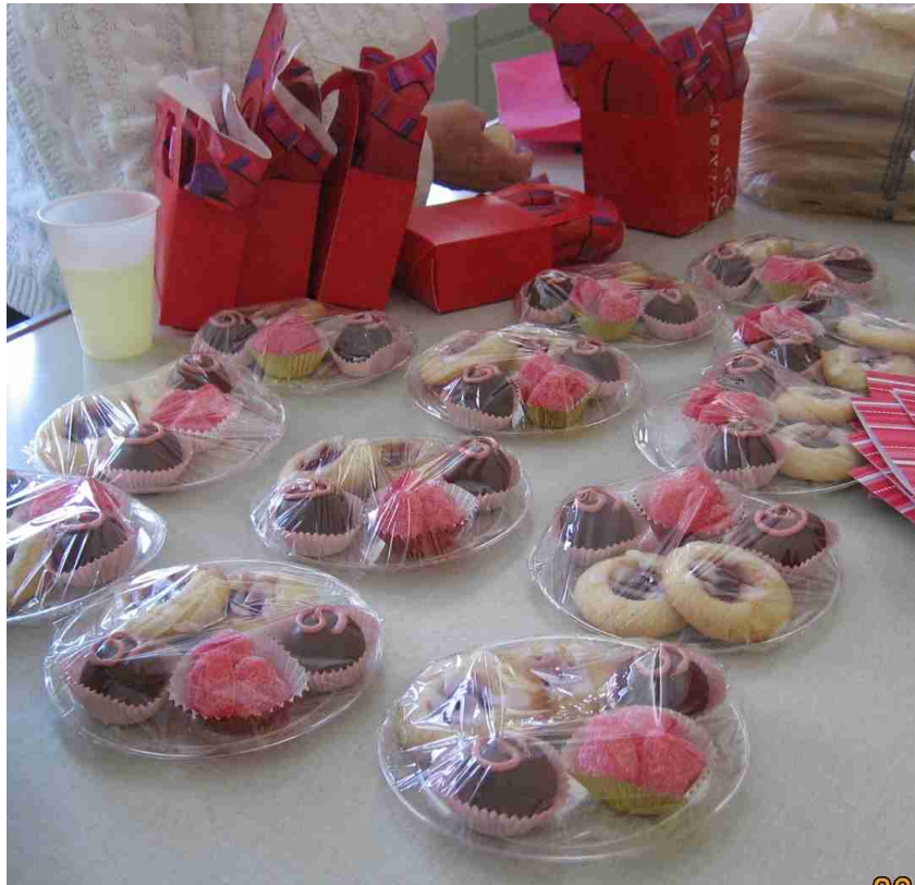
Valentines from Bethel