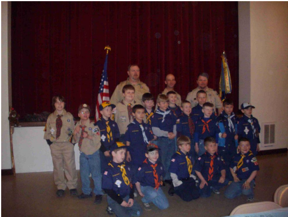
Cub Scout Pack 13

Edith Beahm (540) 943-2974 339 Westminster Drive; Room 121 Fishersville, VA 22939