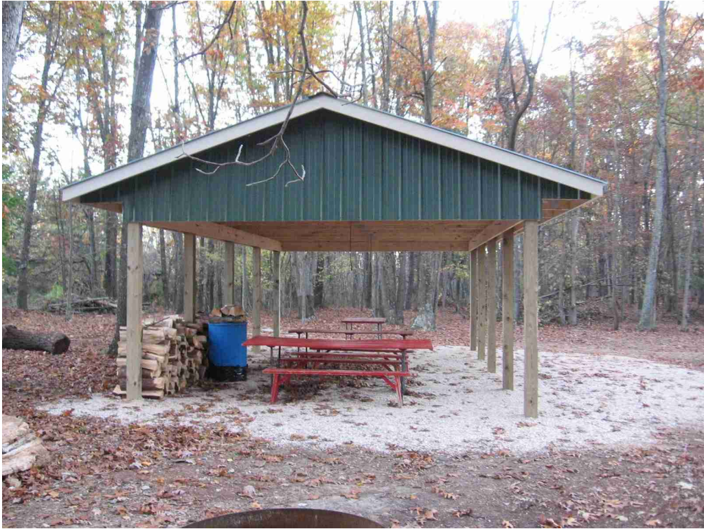
Bethel picnic shelter