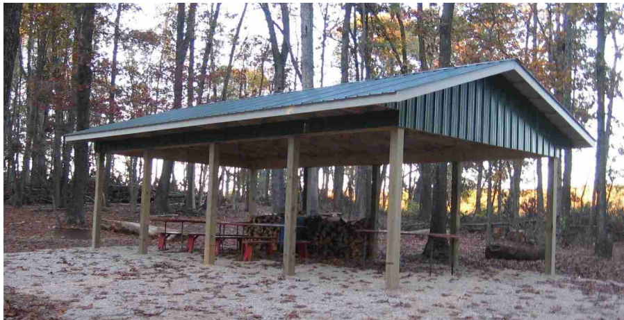
New Bethel Picnic Shelter completed in October

Note, for your information, donating to specific organizations thru the general fund, in lieu of donating to the general fund, does not meet pledge obligations. If you mail contributions to the church for the general fund please address to the Receiving Treasurer to insure proper posting to your account.