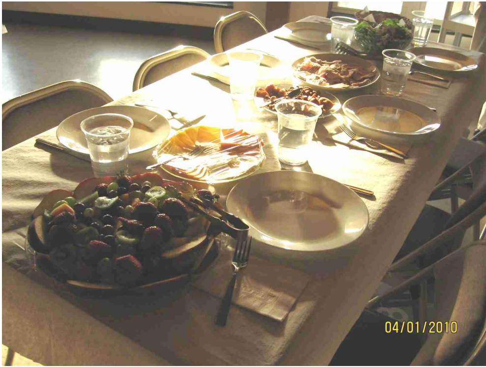
Dinner table on Maundy Thursday