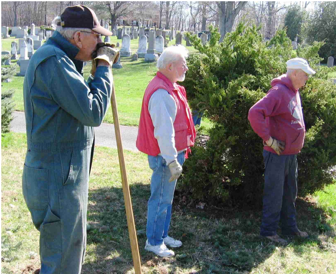
Demolition of the Old Fence